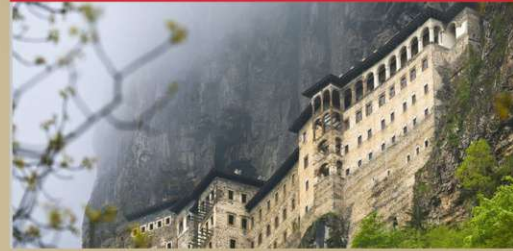
Sümela Monastery The Virgin Mary Monastery