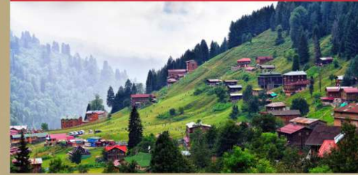
Ayder The Alpine Paradise of Turkey