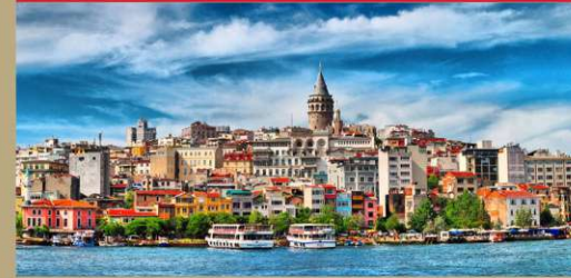
The Maiden's Tower The Beacon of Legends