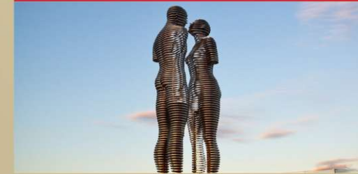
Ali & Nino Statue The Unity Monument