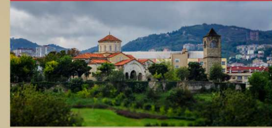
Hagia Sophia The Byzantine Treasure of the Black Sea