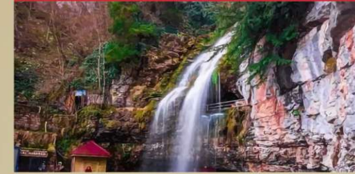
Calkoy Cave The Hidden Jewel of Gümüşhane