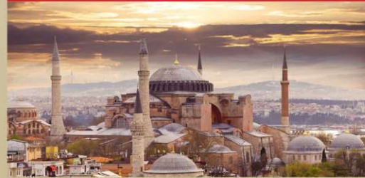
The Blue Mosque The Sapphire of Istanbul