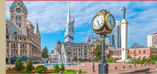
Batumi, Georgia The Las Vegas of the Black Sea