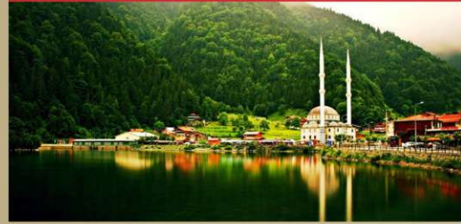
Uzungöl The Pearl of the Black Sea