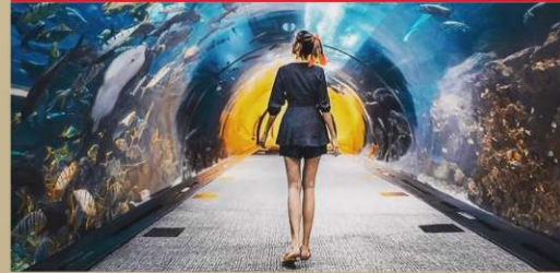
Istanbul Aquarium The Marine Wonderland of Istanbul