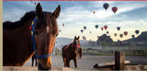
Cappadocia The Land of Fairy Chimneys